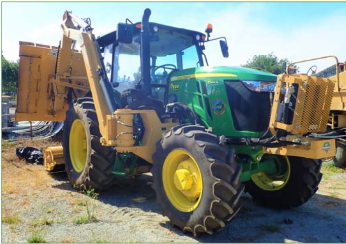
Recently purchased mower for Zone 7