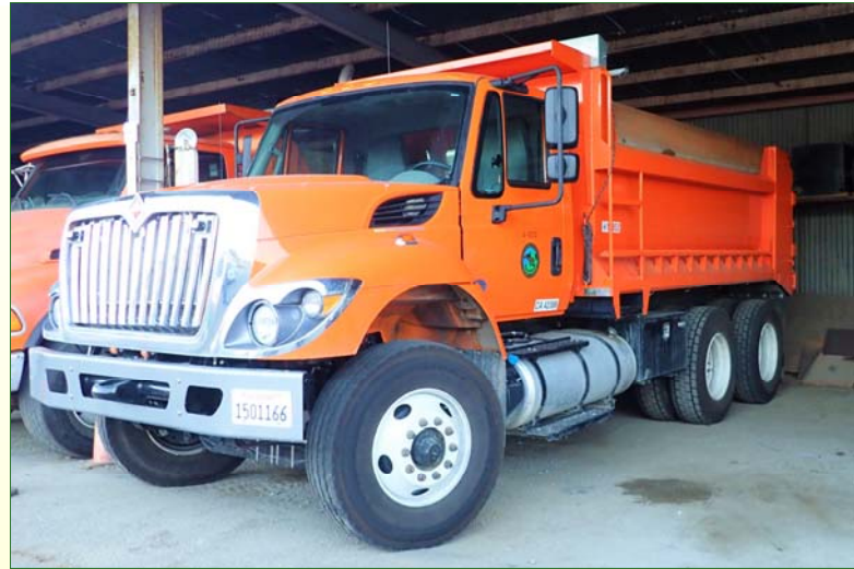
1 of 4 recently purchased dump trucks

An additional effort to fully integrate the Fuel System and Fleet Software is underway. Once complete, it will enhance many of the data structures currently accessed separately. Instead of pulling multiple reports from different systems, Fleet will be able to generate the data from the Fleet Management Software. This will greatly enhance data acquisition and analysis for Fleet assets moving into the future and will assist in maintaining our existing assets and future purchases.